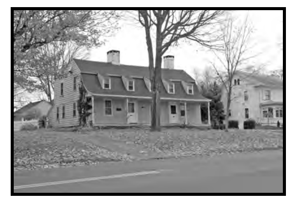
Sanford-Bristol House, c. 1790, saved 2013 by the Milford Preservation Trust and the Connecticut Trust for Historic Preservation

Many of the historic structures lost over the past century might still be standing if buyers, sellers, neighbors, and government leaders had better understood their importance and the alternatives to their demolition. A goal of the Milford Preservation Trust is education about historic preservation and the available help from national and state agencies and preservation groups.