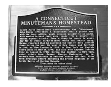
Saved by the Milford Preservation Trust and the City of Milford