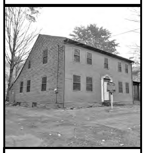
John Downs House c.1790